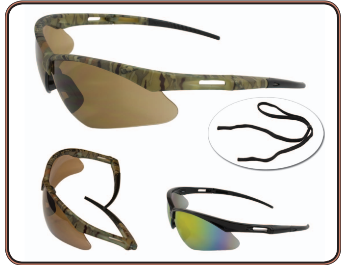
Polycarbonate lenses block 99.9% of the sun's ultraviolet rays. This ultraviolet protection has already been incorporated within the lens material when the lenses are being produced.

Country of Origin/Harmonization Code: Taiwan/9004.90.0000