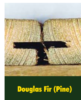
Douglas Fir (Pine)